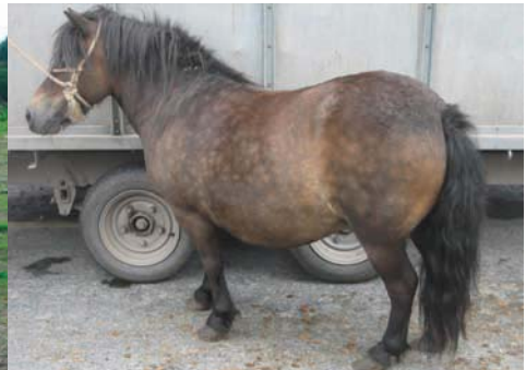
Body Condition Score 5

Horses that live apparently pampered lives can suffer poor welfare as well as those seemingly neglected: horses are social creatures not well designed for isolation in a sterile environment.