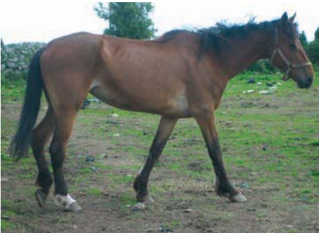
Body Condition Score 1

Horses do not have to be kept stress-free (an impossibility) but subject only to stresses that are not overpowering either in degree or duration. The animals must be able to cope with the environment you keep them in and not suffer long-term loss of health and well-being. Horses must thus be given appropriate food, water and shelter to enable them to maintain physical health; they must not be unnecessarily exposed to injury or disease (or denied treatment should these occur); and should be allowed access to the company of like animals in an environment that does not cause undue distress. Owners/keepers must give attention to horses' basic needs: care of teeth and feet, feeding, shelter, essential vaccinations, companionship, a safe and productive environment, grazing and parasite control, etc. Aim to keep Body Condition Scores (BCS) between 2 and 4 (on a scale of 0 = emaciated to 5 = obese): horses that are significantly under and over-weight suffer from poor welfare.